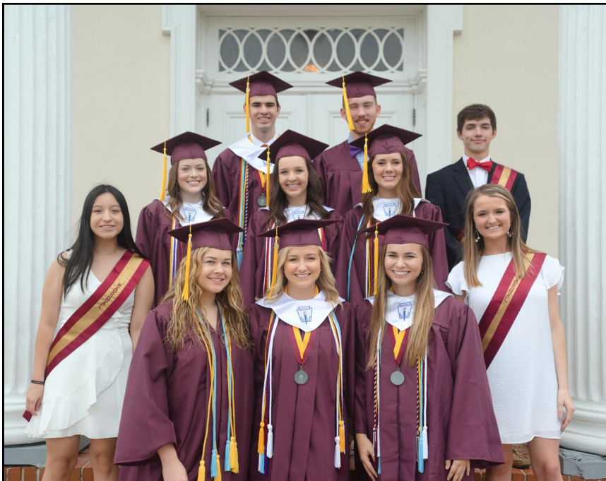
Our graduates were honored at our Baccalaureate Service & Senior’s Luncheon on June 9th, 2019.

We will read from the psalms in our worship services over the next four weeks. In doing so, we will shed light on the thought that the spiritual life is a cyclical journey through orientation, disorientation and reorientation. This Sunday, we will focus on orientation in our reading of Psalm 113. The lyrics of 113 remind us that while the Lord is seated on high he is able to lift the needy from despair. We are always Within Reach of God’s compassion! This is both a mystical and tangible truth. It is mystical in that the Spirit gives us a peace we cannot explain. It is tangible in the acts of kindness and mercy offered by our family of faith.