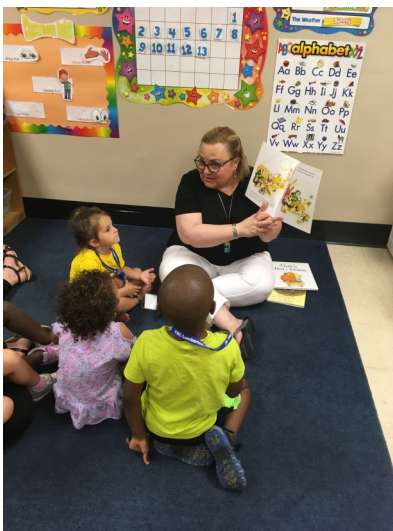
Vacation Bible School June 17-19