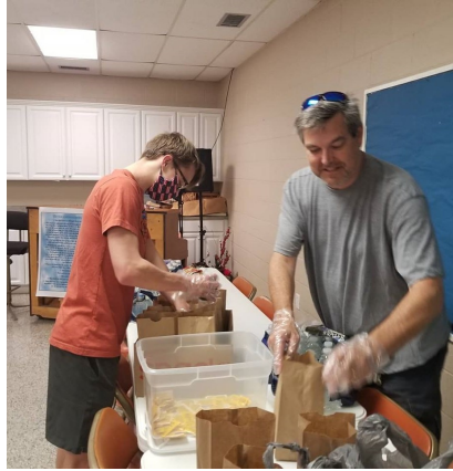
Thanks to everyone to who helped to prepare, pack & serve to-go lunches at our Community Café this past Saturday!