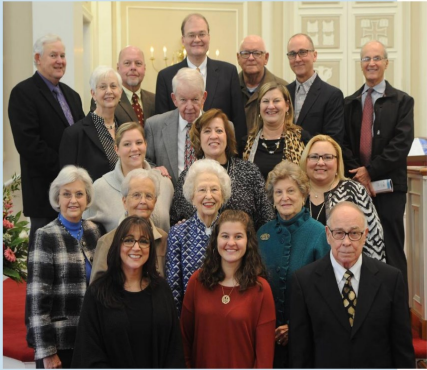
Pictured: The 2019 Deacons

Nominations will be accepted through August 31st! Please fill out the form below or submit your nominations via email to Daphne — daphnefletcher@fbclumbertonnc.org