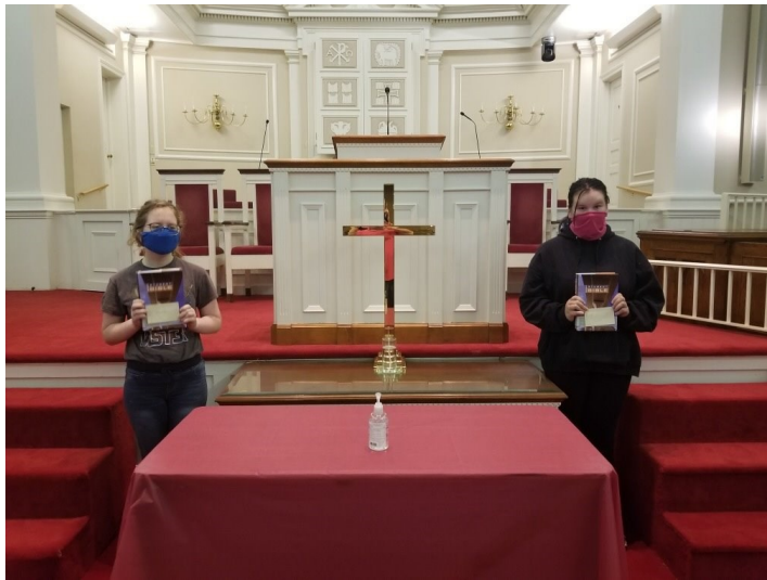
Sunday night, our youth officially (and in a socially distant way) welcomed the new seventh graders into the group! Each seventh grader received a new Bible as part of the welcome. Join us in celebrating these new youth group members!