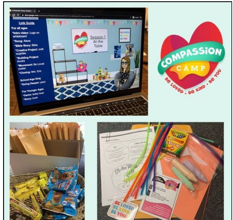
Our children's ministry kicked off virtual Compassion Camp (our fall curriculum) this week! Parents, be sure to take pictures as your kids engage the activities and share them with us!