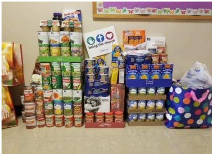
Thank you to everyone who brought food for our First Monday Food Drive this past week!