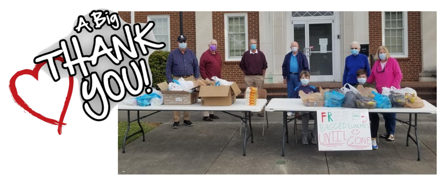
The Collins Sunday School Class hosted Community Café on Saturday, April 17. Thank you for helping serve the needy of Robeson County!