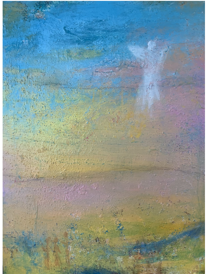
Art by Bobbie Britt