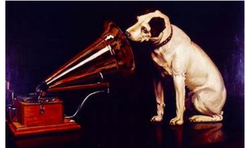
“His Master’s Voice” advertisement by RCA Original work by Francis Barraud was titled “Dog Watching and Listening to a Phonograph”