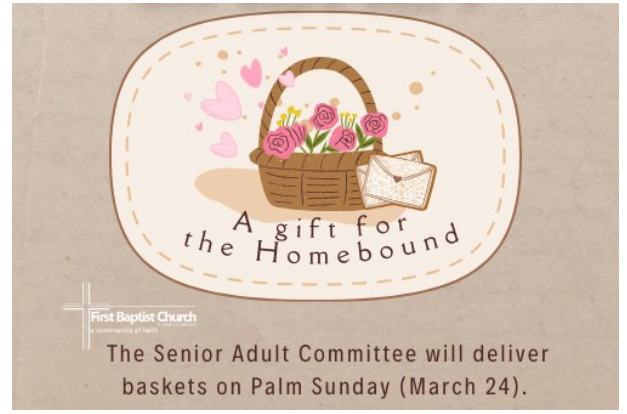
Care Baskets For the Homebound

Our class would love to celebrate Valentine's Day with you! Come out and enjoy great conversations, dancing, and delicious food! Visitors are always welcome, and helpers are greatly appreciated. Please contact Judith at <u>910-740-0622</u> (after 3pm) or Hoss at <u>910-740-0909</u>, and let us know if you are able to help serve food. The party is always great fun, and I promise your heart will be filled with joy when you leave!