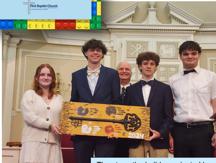
The stone the builders rejected has become the cornerstone. Psalm 118:22