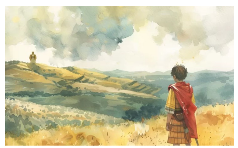
Art from EDENVERSES, artist unknown

Join us for Sunday School at 9:30 am and for Worship in-person at 10:30 am in Cherry Fellowship Hall or online on Facebook Live facebook.com/firstbaptistlumbertonnc or online on YouTube youtube.com/c/lumbertonfbc/