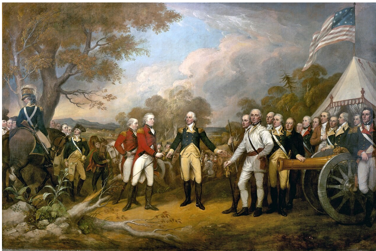
"Surrender of General Burgoyne" by John Trumbull, 1821. It hangs in the Capital Rotunda in Washington, D.C.

Preparing for Sunday, June 30, 2024 "Praising our Enemies" 2 Samuel 1:1, 17-27 (NLT)