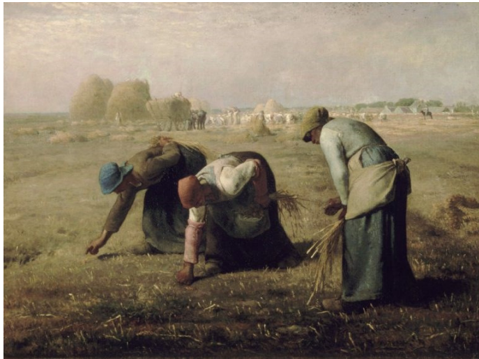
Jean-François Millet, The Gleaners , 1857, Paris, France.