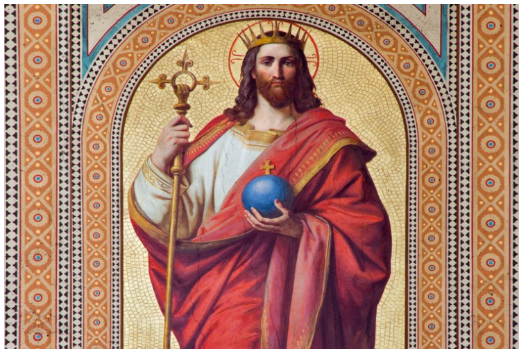
Fresco of Jesus Christ, King of the World, by Karl von Blaas (19th century), in the nave of Altlerchenfelder Church in Vienna, Austria.

Preparing for Sunday, November 24, 2024 Christ the King Sunday