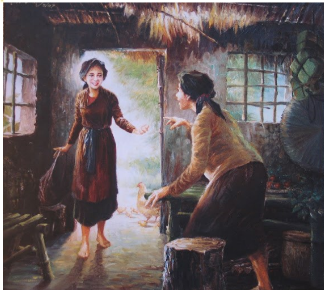
"Mary Visits Elizabeth," Vietnam, Artist Unknown