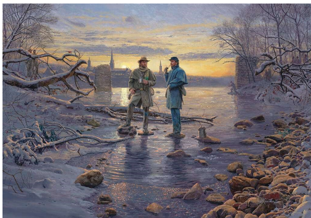
“My Friend, the Enemy, Rappahannock River, VA, December 25, 1862” oil painting by Mort Künstler, 1989

Preparing for Sunday, February 23, 2025 Luke 6:27-38 (NLT) “Letting the Other Side Win?”