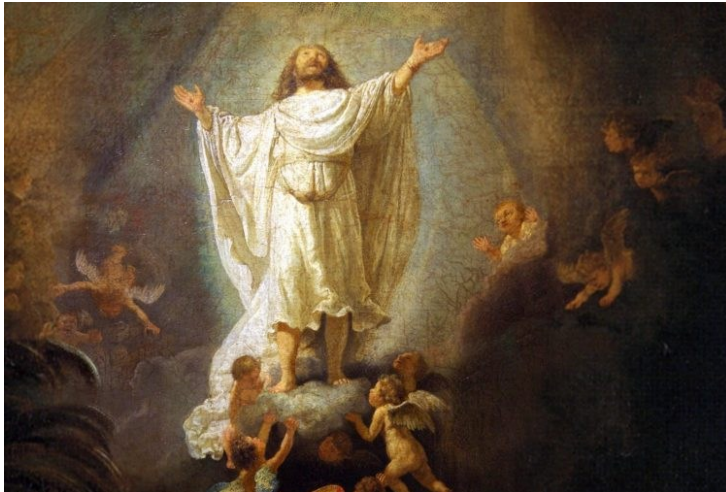
A portion of "The Ascension," by Rembrandt, c.1636, Alte Pinakothek, Munich