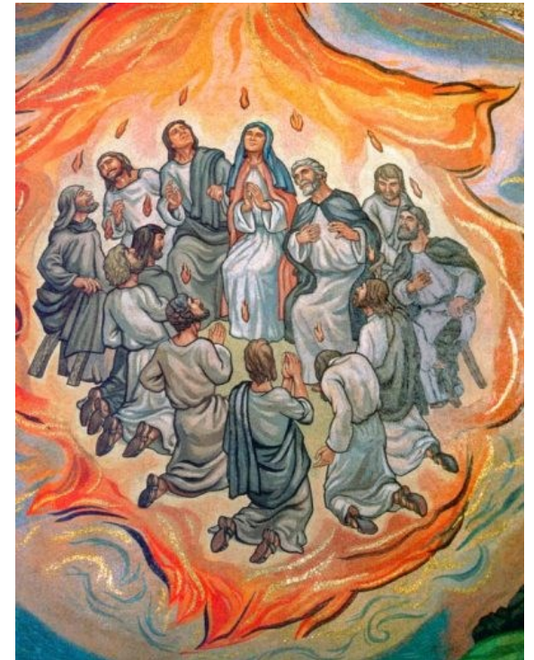
An artist's depiction of a scene from the Pentecost appears in the Cathedral Basilica of St. Louis, Missouri.