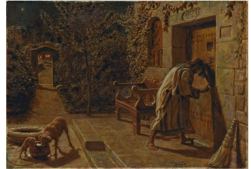
"The Importunate Neighbor" by William Holman Hunt, 1895