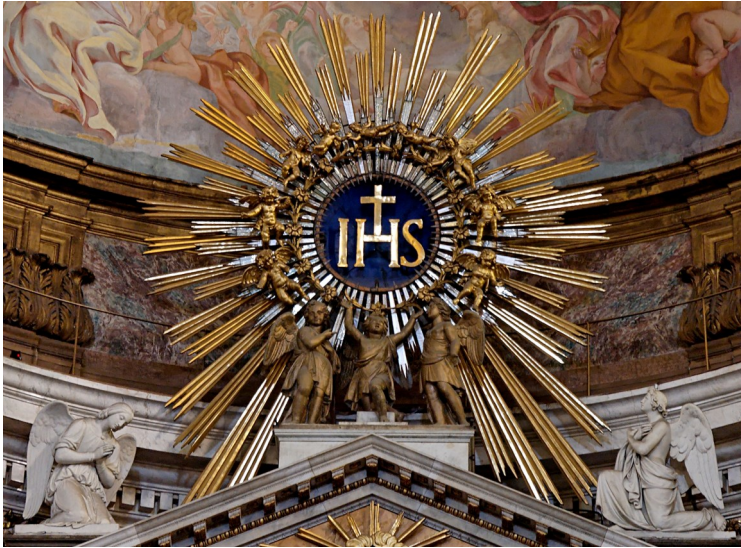
IHS monogram, with kneeling angels, atop the main altar, Church of the Gesù, Rome

Preparing for Sunday, December 28, 2025 The Fourth Day of Christmastide "The Holy Name of Jesus" Luke 2:15-21 (NLT)